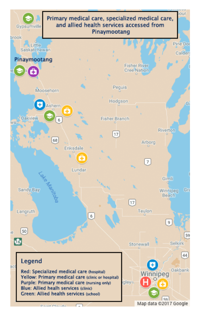
Figure 1. Services accessible to children living in Fairford reserve (Pinaymootang First Nation), in nearby communities, and in Winnipeg. Original data: Google Maps (n.d.).